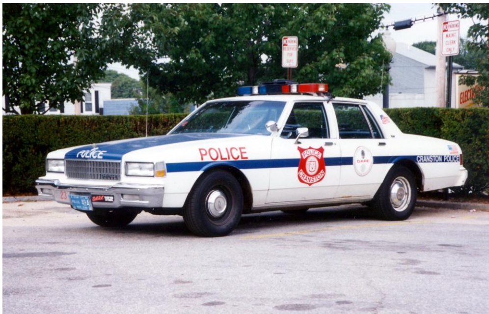
First DARE vehicle, a 1987 Chevrolet with DARE emblem on rear door.