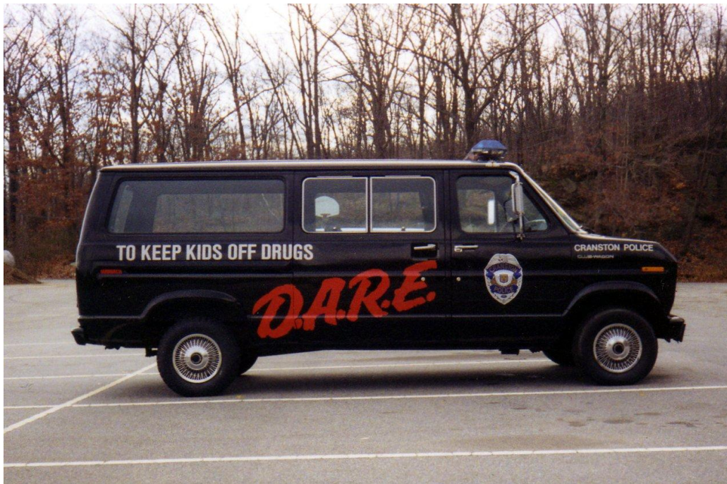
DARE van, a 1987 Ford