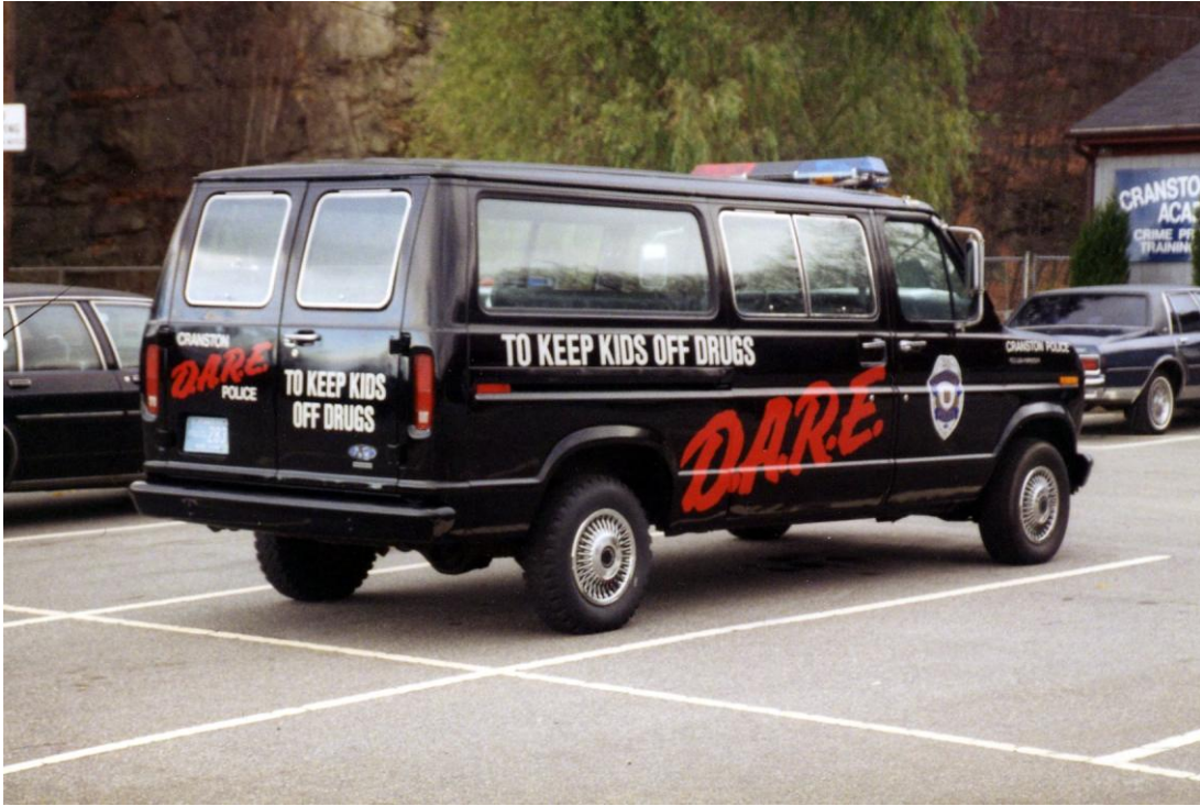
Rear View of DARE van - 1995