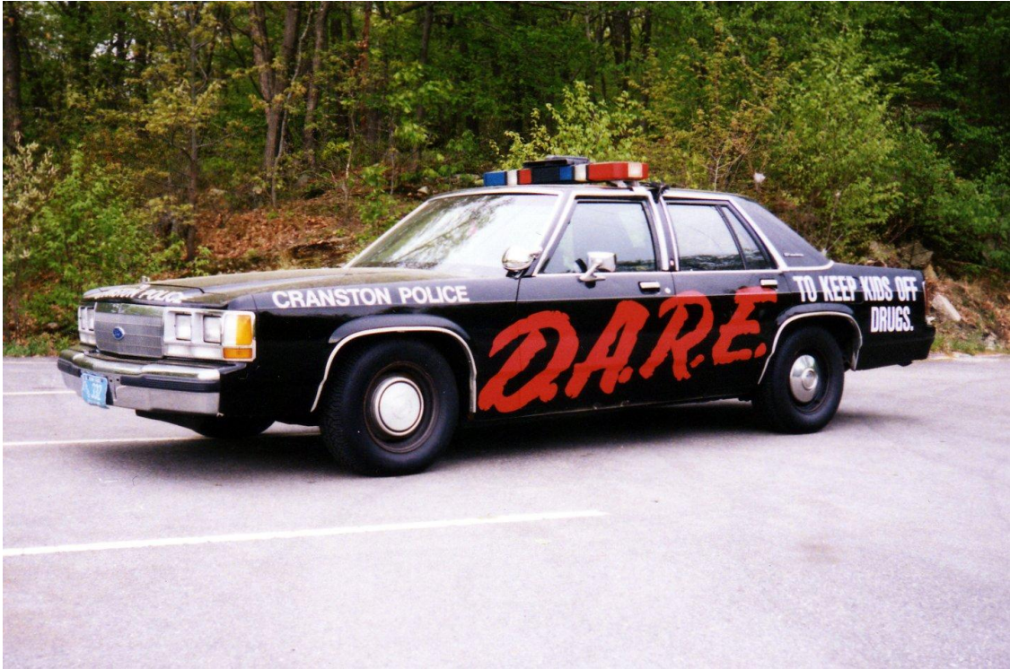
DARE Officer's car, a 1990 Ford.