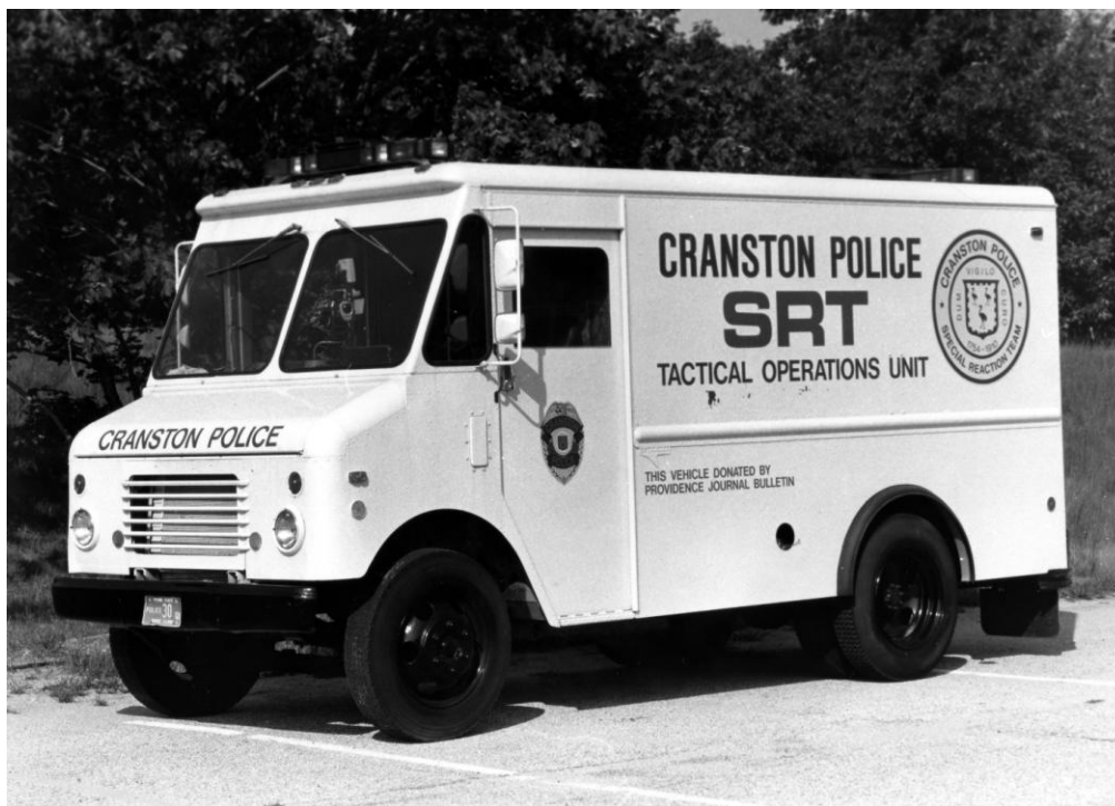
Third truck used by the SRT Team, a retired Providence Journal delivery truck. It was donated to the police department in June of 1993.