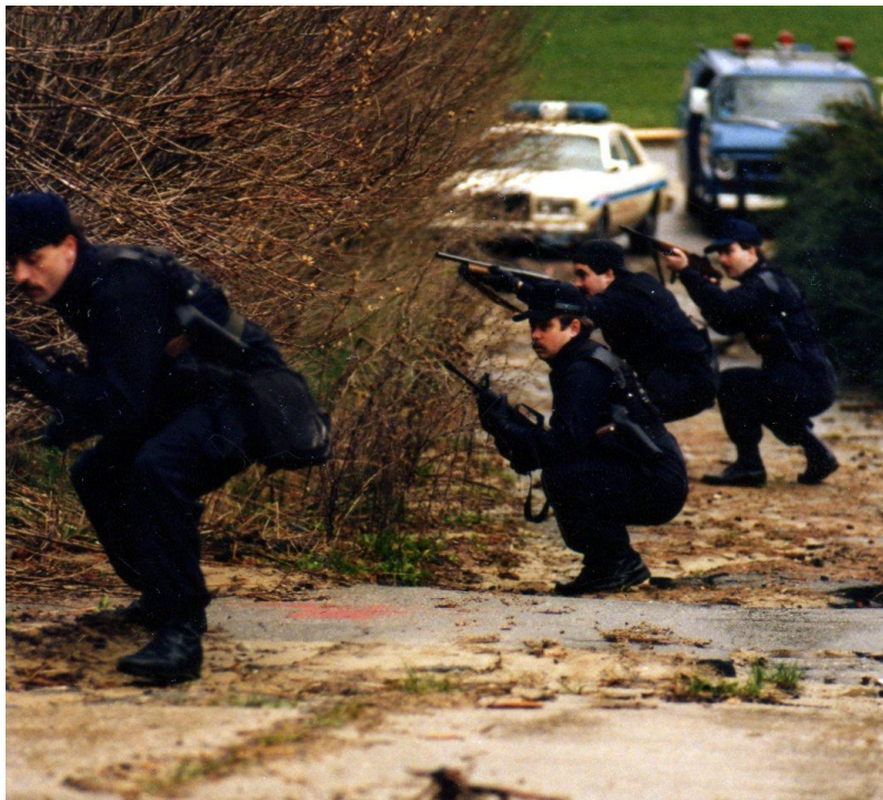
SWAT training - circa 1983

Regardless of a members rank, no rank insignia are worn on the uniforms because the team acts as a unit, and each member is assigned a task that he is best suited for. Jobs include snipers, spotters, hostage negotiators, and entry team.