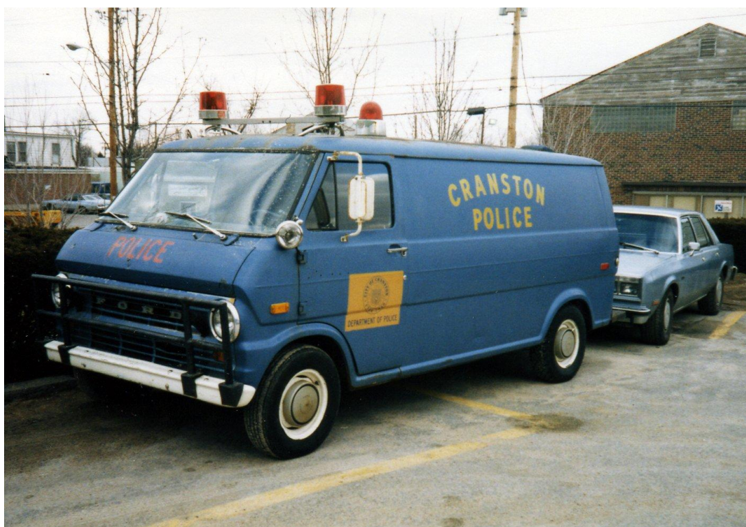
The first van used by the SWAT Team from 1980 to 1988. A 1975 Ford Econoline