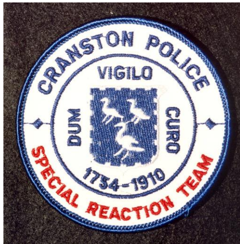
Prototype with white background. Never issued.

Two other variations of this patch were produced. One had an olive green background and the other a white background. Neither of those variations were worn.