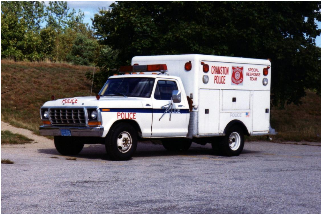
Second truck used by the team, a retired fire/rescue truck. Used from 1988 to 1994.