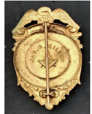
Cranston Chief's badge with Masonic emblem on back