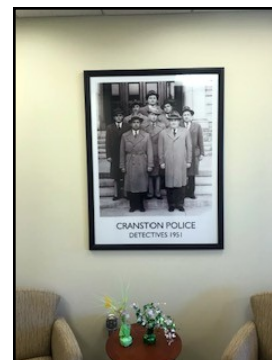
(Left) A photo of CPD detectives taken in 1951 was enlarged to poster size and now adorns the waiting area of the detective division at the police station.