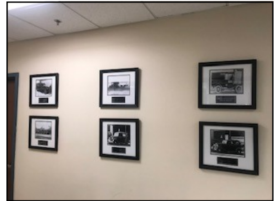
Vintage Photos of days gone by.