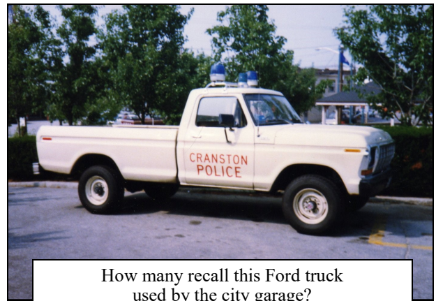
How many recall this Ford truck used by the city garage?