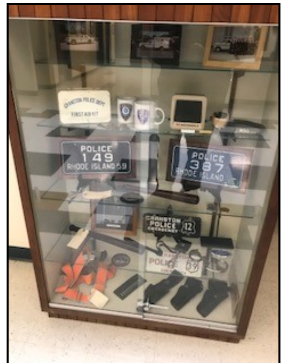
One of the display cases in the inner lobby of the new police station. New officers seem to be very interested in the project.