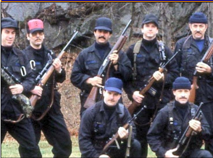
Members of the SWAT Team Circa 1980