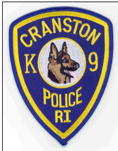
CPD K-9 officers are now

The history of utilizing dogs for police work likely dates to the earliest days of law enforcement, and it's possible that Cranston constables of the 18th and 19th centuries did so, but this is only speculation as such documentation is non-existent.