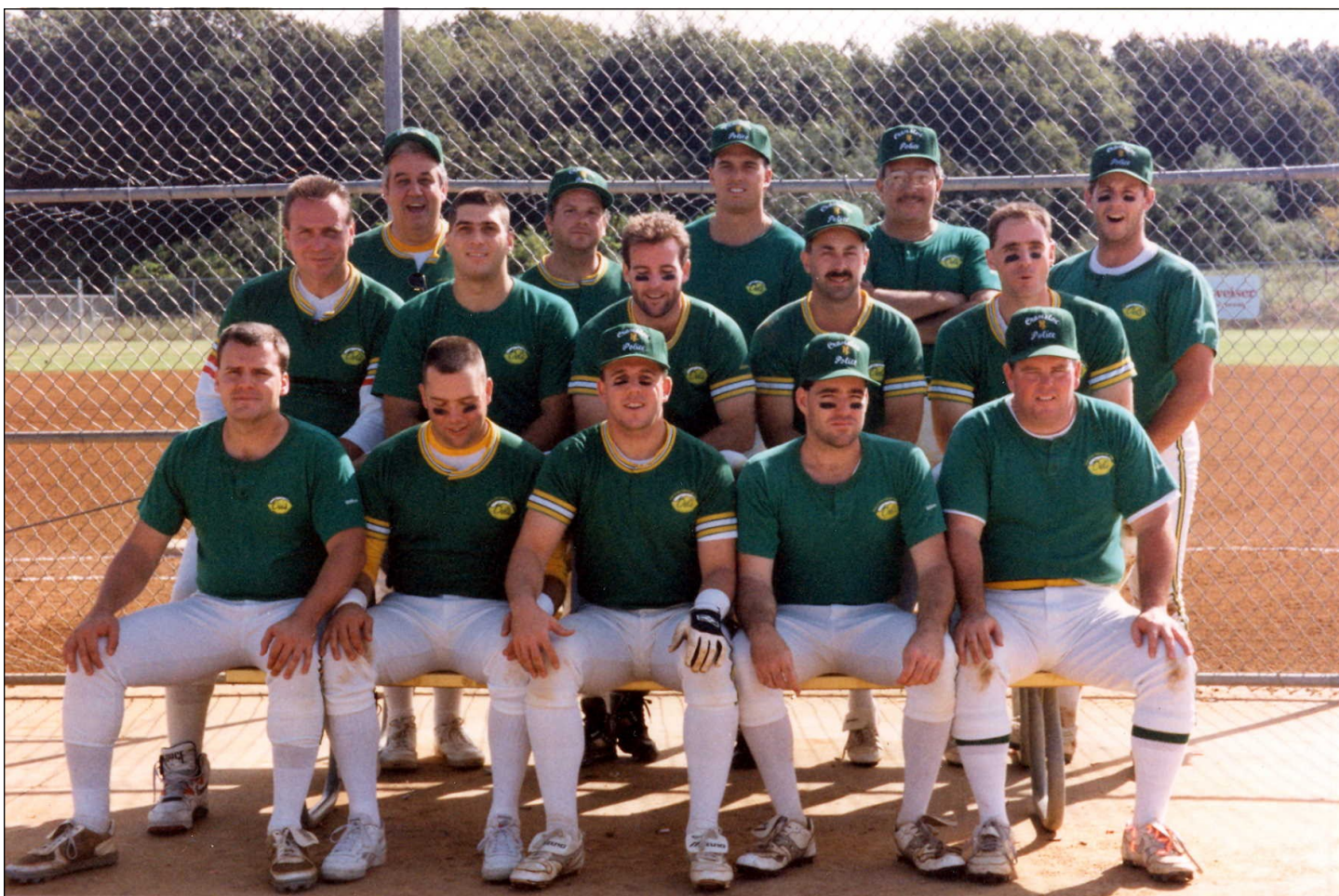
Cranston Police Baseball Team—1991